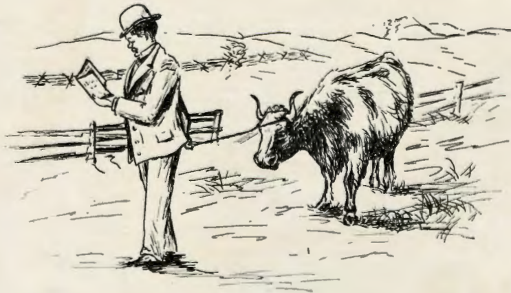
MARRIED LIFE AT I. U.