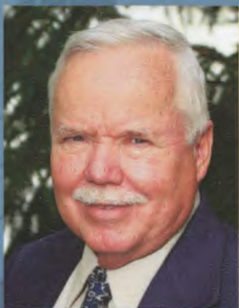
Edward C. King JD'64

In 1980, he was asked to return to Micronesia to become the first chief justice of the now self-governing Federated States of Micronesia, a position he held until 1992. King eventually returned to the NSCLC in 2002, after serving as a justice in two other Pacific Island jurisdictions and as a Federal Magistrate Judge for the U.S. District Court for Hawaii. Retired from the NSCLC, King continues to seek ways to serve.