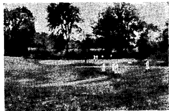
A view on the fine 18-hole golf course.