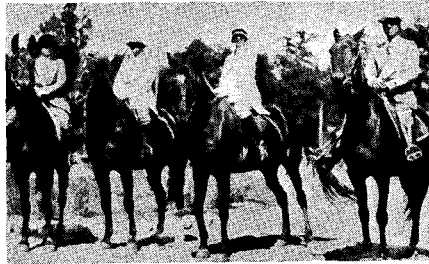
There is an excellent stable adjoining the grounds.