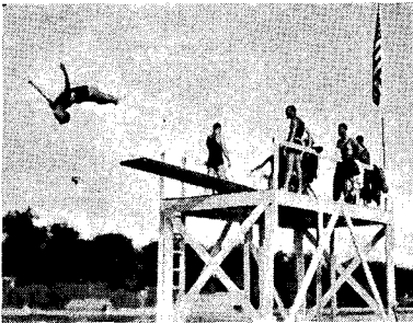
The Diving Tower