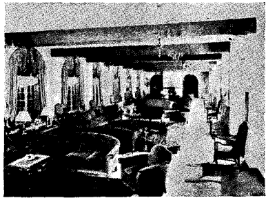
The luxurious Marine Lounge.